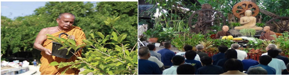
Picture 3 SuanKeaw Temple in Nonthaburi Province by Loungpor Pa Yom(b.1949-) and SantiAsoke Communities who management temple and communities base on Buddhist economic or sufficiency of economy, the use of resources according to the Buddhist concept of sufficiency.